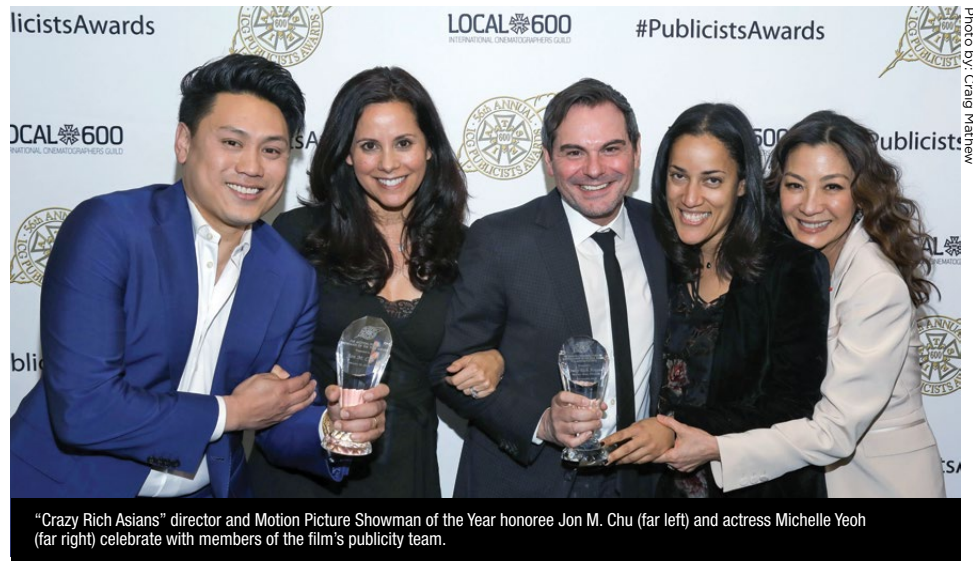
“Crazy Rich Asians” director and Motion Picture Showman of the Year honoree Jon M. Chu (far left) and actress Michelle Yeoh (far right) celebrate with members of the film’s publicity team.