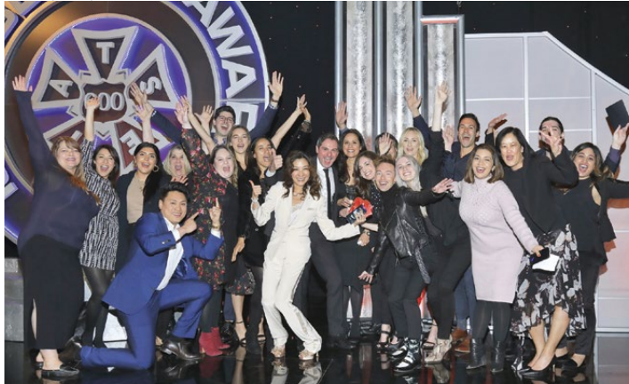
The Warner Brothers team whose campaign for “Crazy Rich Asians” won the Maxwell Weinberg Publicist Showmanship of the Year Award for Motion Pictures.