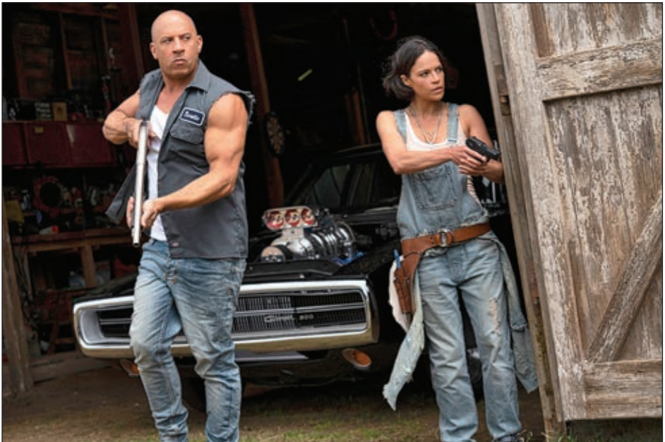
The ICG Publicists Who Publicized F9: The Fast Saga (Universal Pictures)