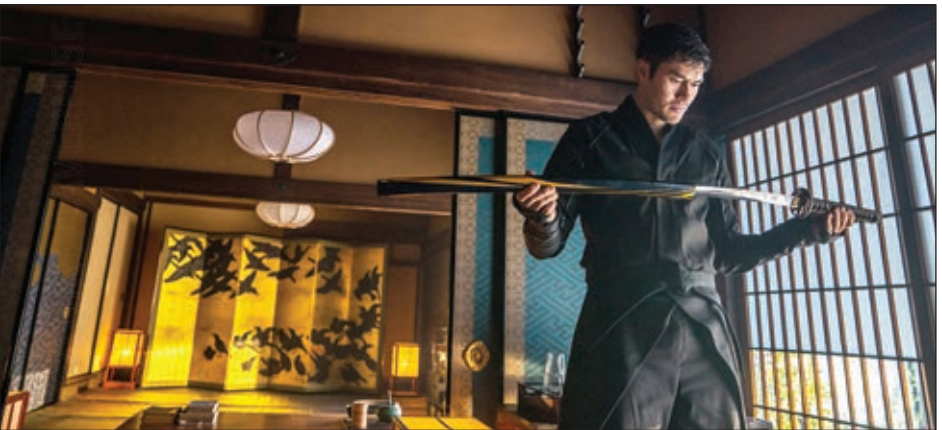
GI Joe Snake Eyes