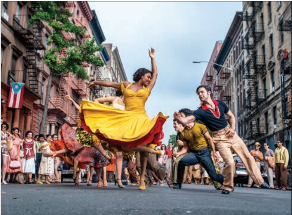
The ICG Publicists Who Publicized West Side Story (20th Century Studios / Walt Disney Studios)