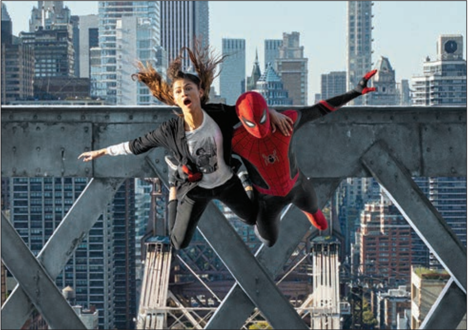
The ICG Publicists Who Publicized Spider-Man: No Way Home (Sony Pictures Entertainment / Marvel Studios)