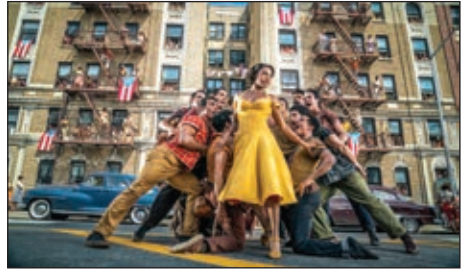
West Side Story