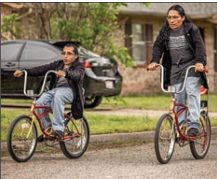
Reservation Dogs - Season One