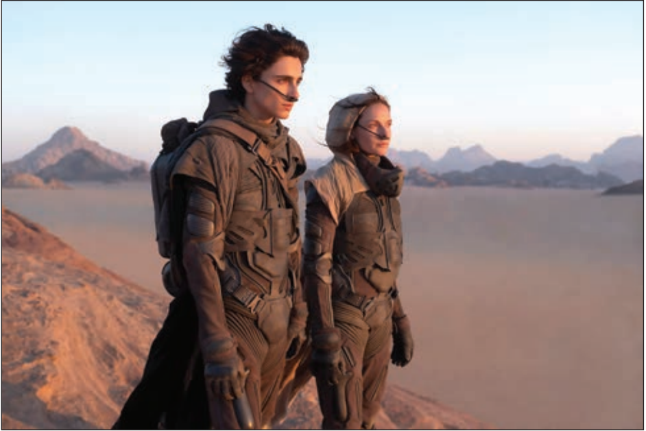
The ICG Publicists Who Publicized Dune (Warner Bros. Pictures & Legendary Pictures)