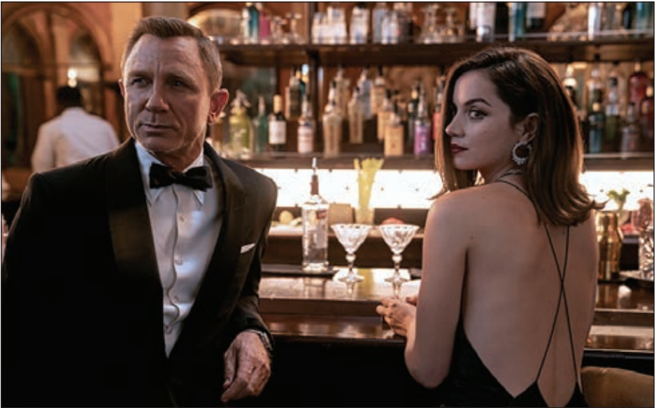
No Time To Die