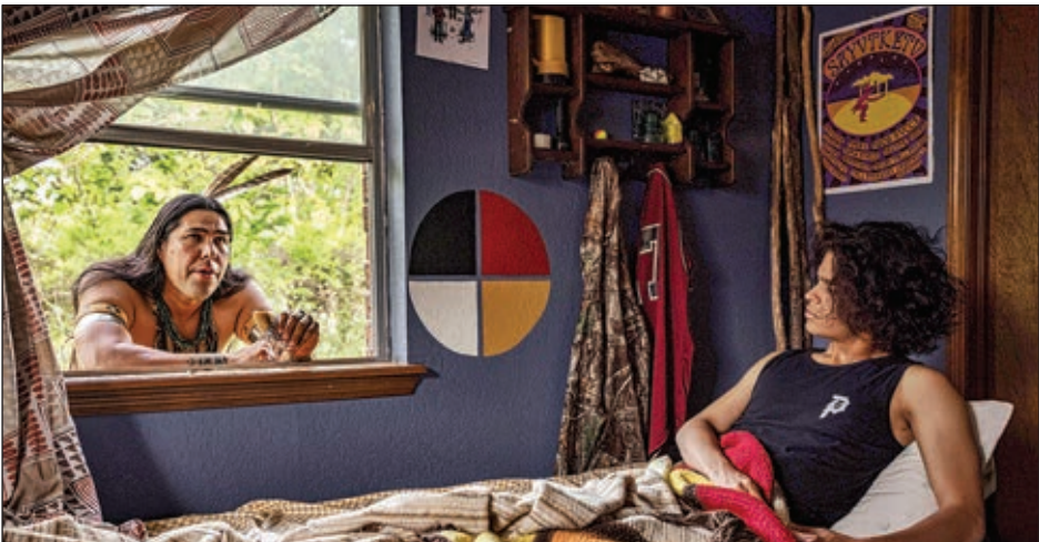
Reservation Dogs - Season One