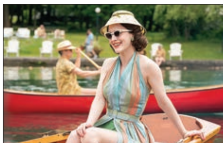
The Marvelous Mrs. Maisel