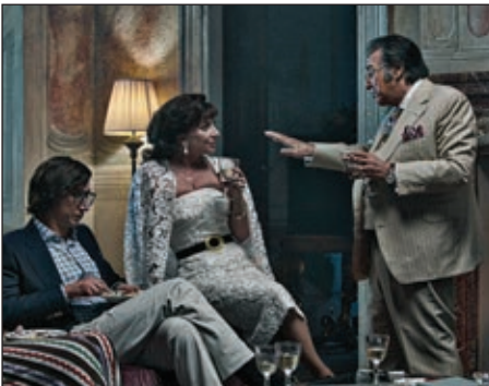
House of Gucci