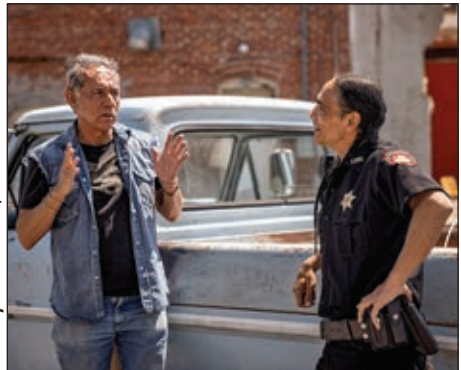
Reservation Dogs - Season One