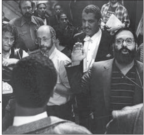
The Cotton Club