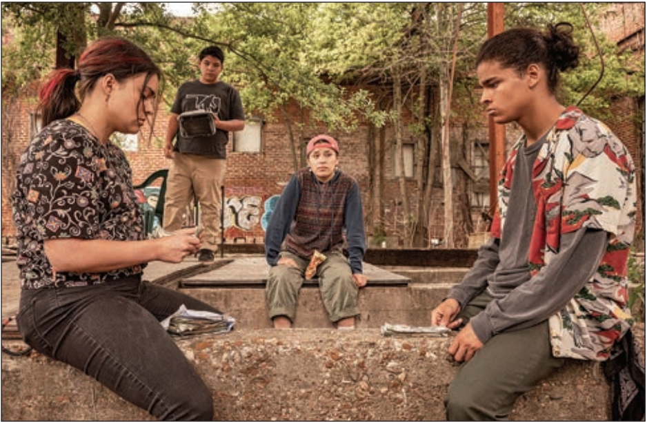
Reservation Dogs - Season One