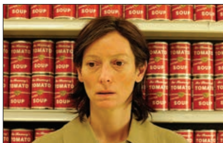
We Need to Talk About Kevin