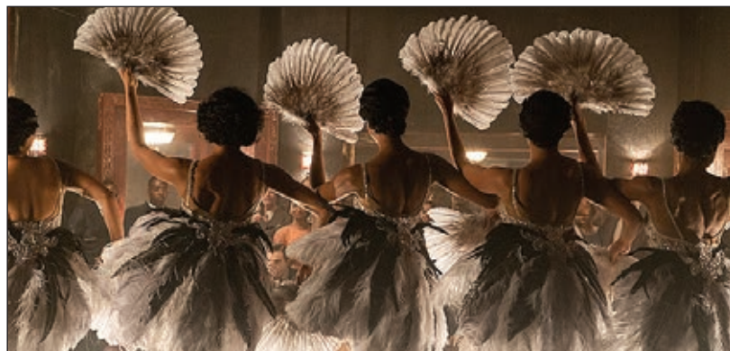
Z—The Beginning of Everything