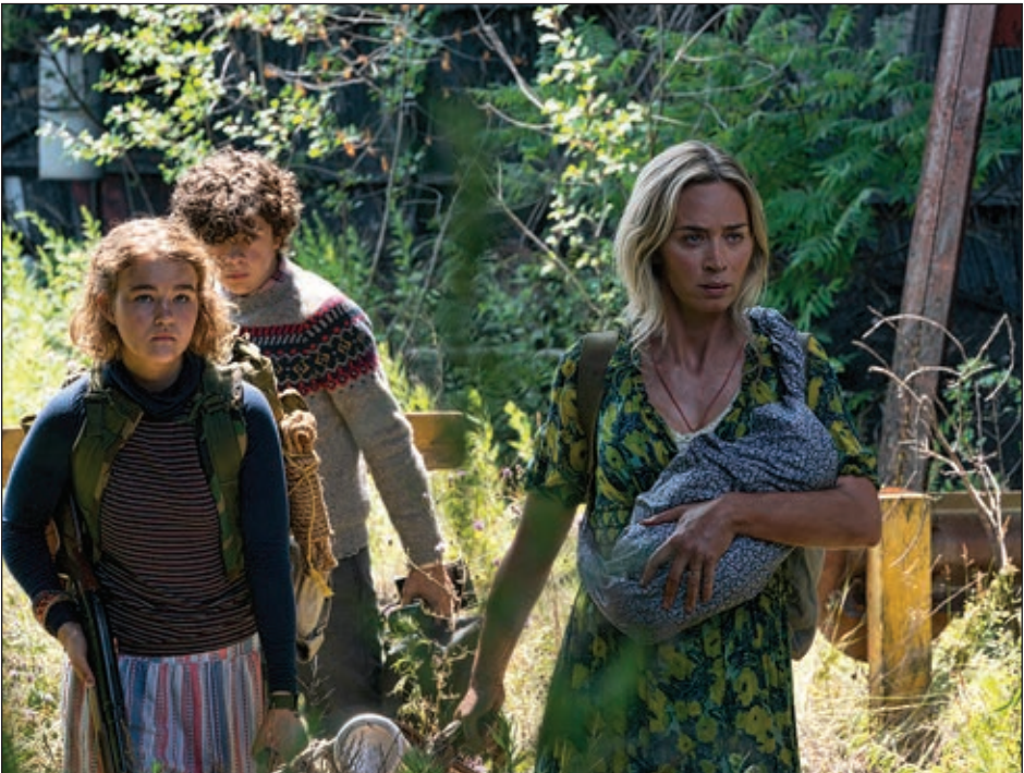
The ICG Publicists Who Publicized A Quiet Place Part II (Paramount Pictures)