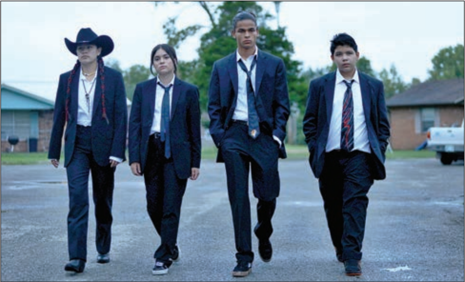
Reservation Dogs - Season One