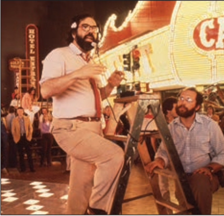
One From The Heart