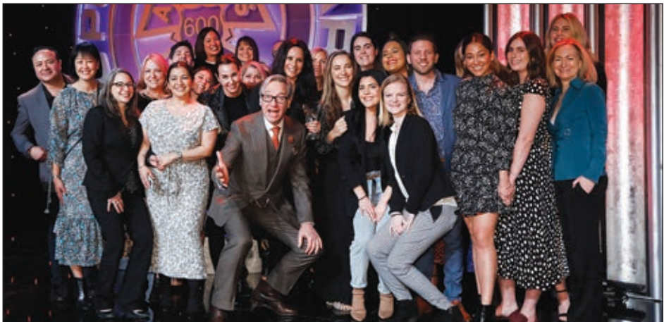
Director Paul Feig presents the Maxwell Weinberg Award for a Motion Picture Campaign to the Warner Bros. Publicists who worked on Joker