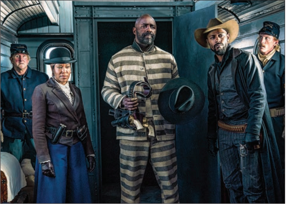
The ICG Publicists Who Publicized The Harder They Fall (Netflix)