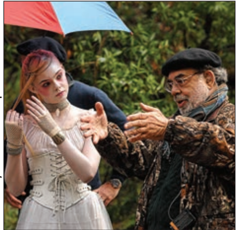
B'Twixt Now and Sunrise

Lucas, and John Milius. Zoetrope was also a key pioneer of previsualization (Coppola coined the term), HD, electronic editing, and using the Ethernet for inter-departmental communications.