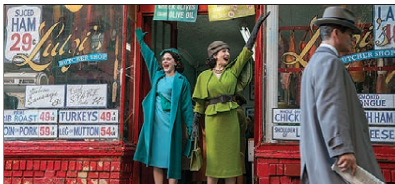
The Marvelous Mrs. Maisel