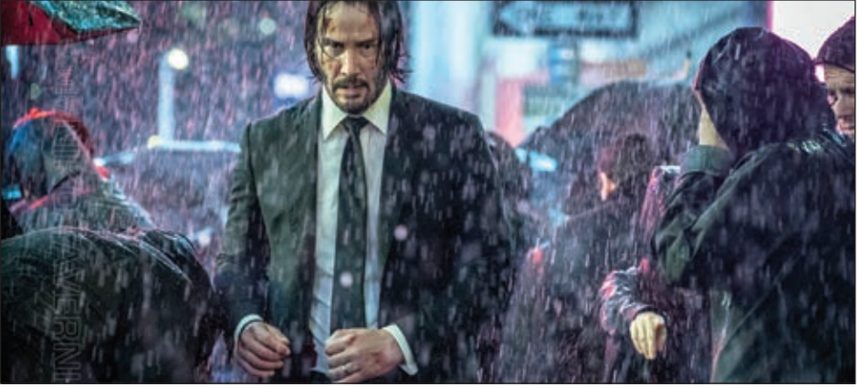
John Wick 3